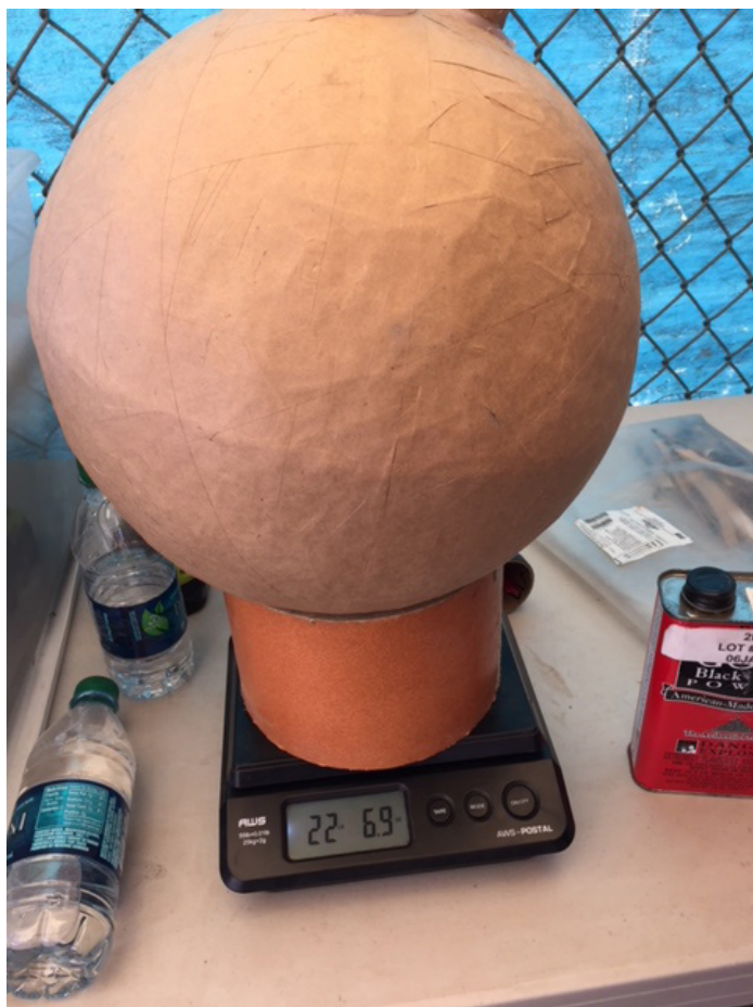
Barry's 12