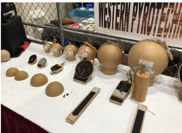
Inert shells for demonstration

From the beginning of the three day show until we went home, our booth was packed with people who wanted to know about fireworks. "How do you build a shell?" "How do you send it in the air?" "How do you make a smiley face?" If all we did was answer questions, our mission was accomplished because we did public outreach. However, a lot of people were astounded to learn that they too could build shells. They too could work with fireworks without the need to be employed in the fireworks industry. All they had to do was become a member of our club.