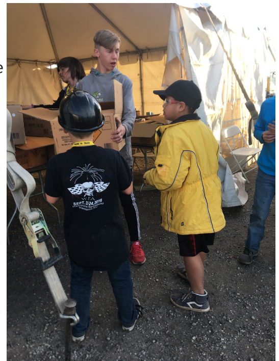
Team-building exercise (aka, "kids, unload all this stuff")

The actual show setup part on Sunday was much like last year; a time of too-much-to-do, lots of choices, and decisions to be made and working alongside not only your peers, but also your parents' peers.