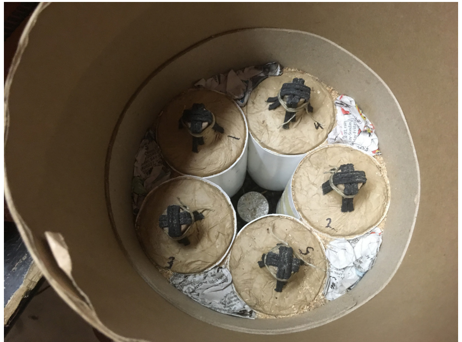
5 timed reports in an 8" case

For those of you who have seen the Dr. X pre-shows or watched any of the numerous videos on YouTube, you know that their display relies largely on noise-based effects.