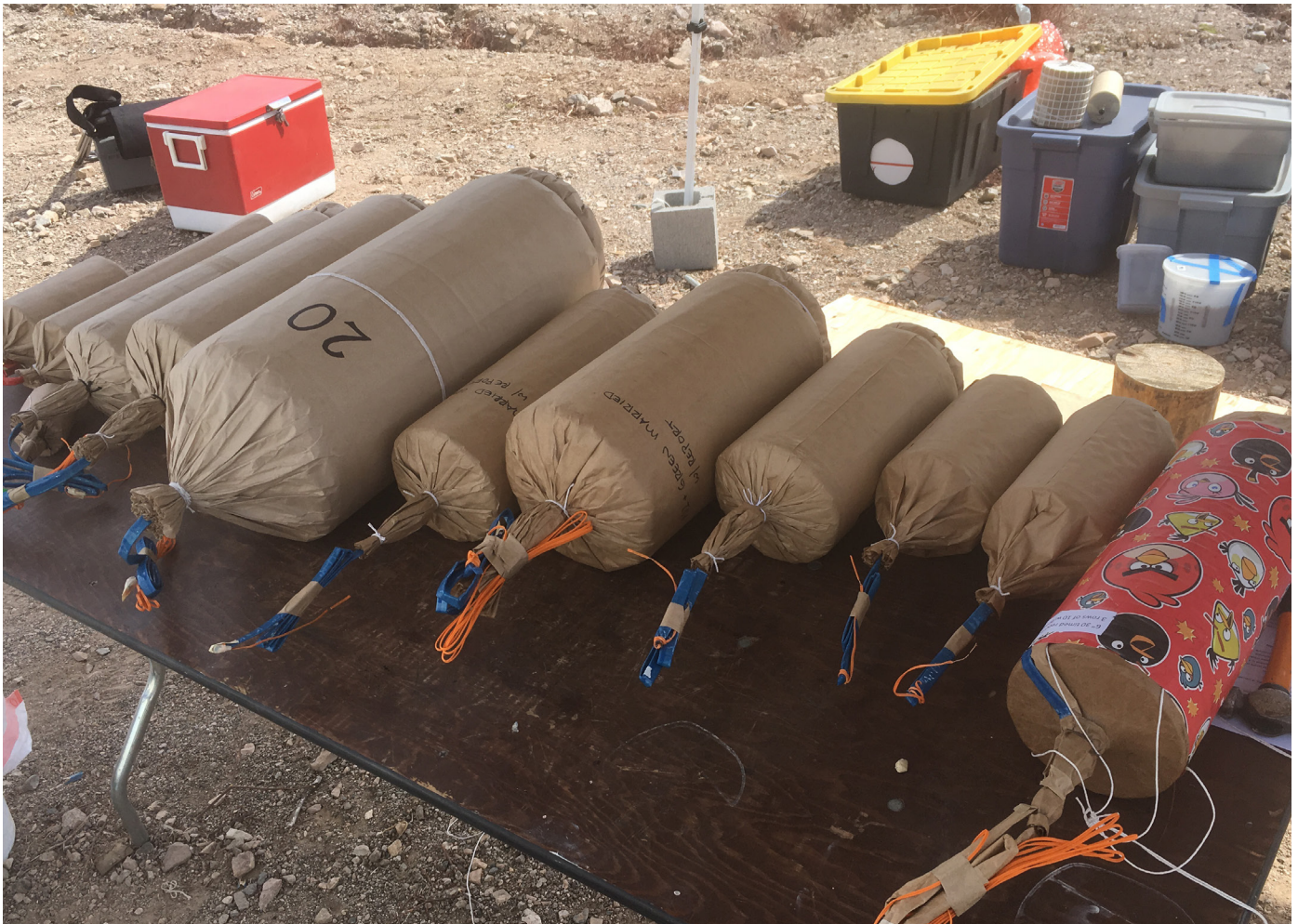
5" - 10" member made cylinder shells, ready to load