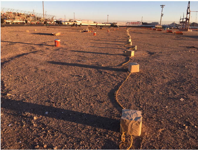
Lots of donated fancakes!! The PIT Crew are definitely fans of those