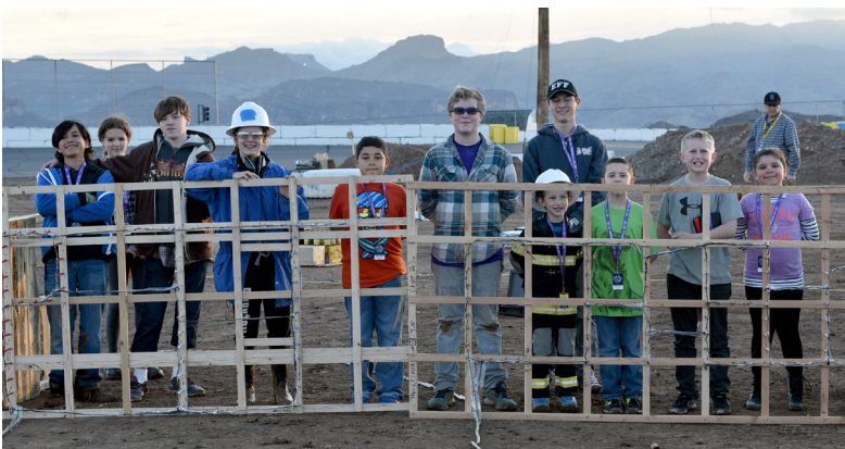
The Future WPA Board of Directors